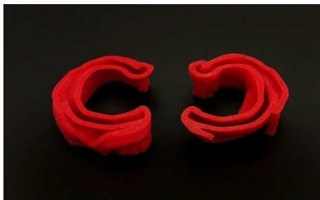
Figure 3. 3D Printed Acetabular Labrum Mold

impression. A PLA mold silicone is poured into the space created by the internal plaster impression and pressed with the external mold. The casts are opened and the labrum is revealed after a 1 hour polymerization time. Precise anatomical compliance to the model is verified and approved by the multi-disciplinary team (including the orthopedions), and the labrum is then placed on a mannequin for academic and illustrative purposes (Fig. 3).